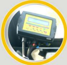
SLI monitoring system