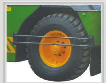
Heavy duty rear tyres 14.00x25- 20PR Tyre guards for safety