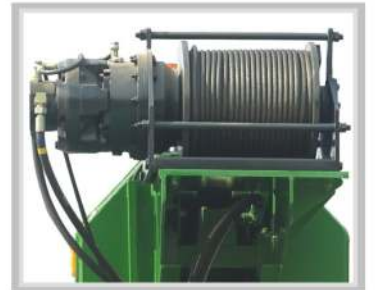
Heavy duty winch