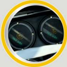
Equipment Monitoring System and FM radio with speakers