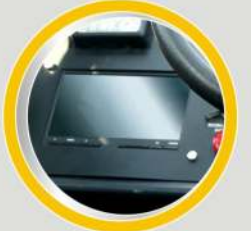
LCD for rear view camera