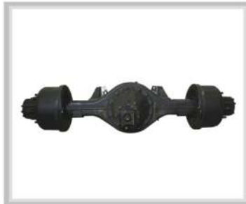
Heavy duty rear drive axle