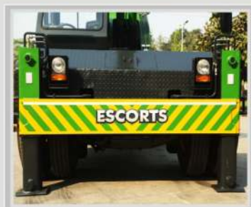
Outriggers for safety