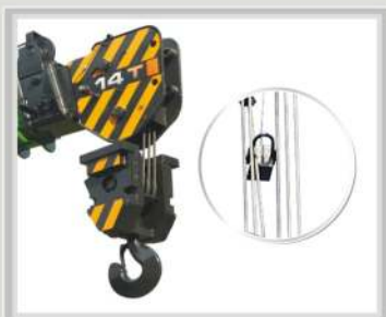
Only crane with a lifting capacity of 14 ton at snatch block