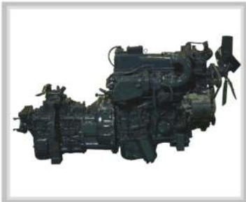
Volvo Eicher E483 TC 80 HP fuel efficient engine with 10 forward and 2 reverse synchromesh gearbox